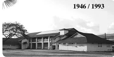
1946 / 1993