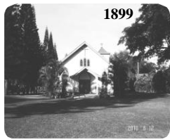
Sacred Heart of Jesus & Mary at Waimea