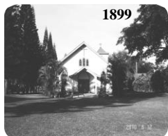
1899 Sacred Heart of Jesus & Mary at Waimea