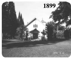
1899 Sacred Heart of Jesus & Mary at Waimea