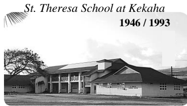
St. Theresa School at Kekaha 1946 / 1993

Mahalo for your support for our playground renovations