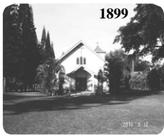
Sacred Heart of Jesus & Mary at Waimea