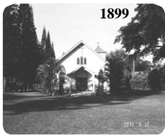
1899 Sacred Heart of Jesus & Mary at Waimea