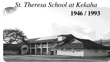
1946 / 1993 St. Theresa School at Kekaha