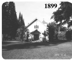
1899 Sacred Heart of Jesus & Mary at Waimea