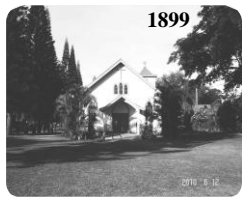
1899 Sacred Heart of Jesus & Mary at Waimea