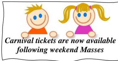
St. Theresa School at Kekaha

Vision/Mission Statement To make St. Theresa Parish a dynamic Christian community of worship & service