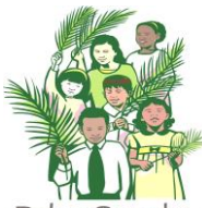
Palm Sunday St. Theresa School at Kekaha

1940 / 1978 Vision/Mission Statement To make St. Theresa Parish a dynamic Christian community of worship & service