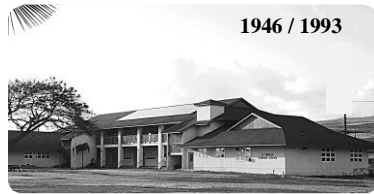
1946 / 1993