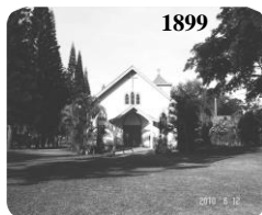
1899 Sacred Heart of Jesus & Mary at Waimea