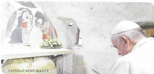
CATHOLIC NEWS SERVICE

January 1, 2023 Blessed Virgin Mary, the Mother of God Nm 6:22–27 Gal 4:4–7 Lk 2:16–21