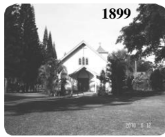
1899 Sacred Heart of Jesus & Mary at Waimea