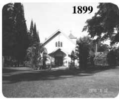
1899 Sacred Heart of Jesus & Mary at Waimea