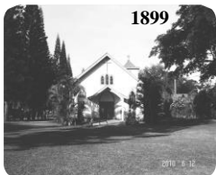
Sacred Heart of Jesus & Mary at Waimea