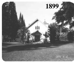
Sacred Heart of Jesus & Mary at Waimea