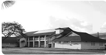
St. Theresa School at Kekaha