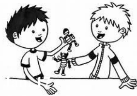
St. Theresa School at Kekaha

Vision/Mission Statement To make St. Theresa Parish a dynamic Christian community of worship & service