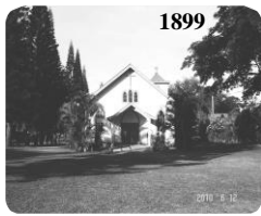
Sacred Heart of Jesus & Mary at Waimea