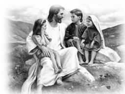
St. Theresa School at Kekaha

Vision/Mission Statement To make St. Theresa Parish a dynamic Christian community of worship & service