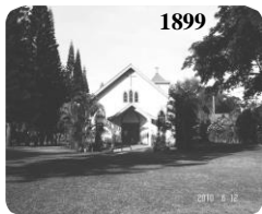
Sacred Heart of Jesus & Mary at Waimea