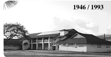
1946 / 1993

"The Eucharist is the heart of the Church and the heart of our lives as Catholics. In the Holy Eucharist, Jesus Christ himself draws near to each one of us personally and gathers us together as one family of God and one Body of Christ."