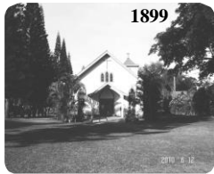
Sacred Heart of Jesus & Mary at Waimea