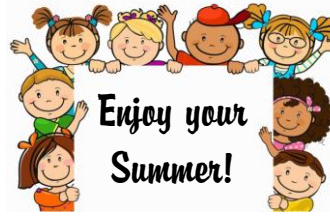
St. Theresa School at Kekaha

Vision/Mission Statement To make St. Theresa Parish a dynamic Christian community of worship & service