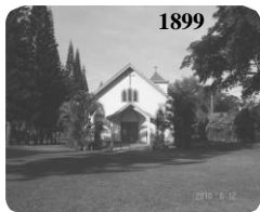
Sacred Heart of Jesus & Mary at Waimea