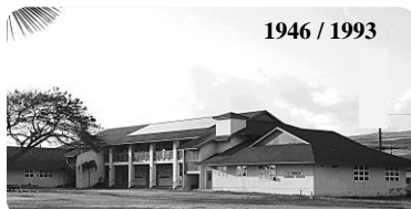
1946 / 1993

The liturgical season of Christmas began with the vigil Masses on Christmas Eve and concludes today on the Feast of the Baptism of the Lord. During this season, we celebrated the birth of Christ into our world and into our hearts, and reflected on the gift of salvation that was born with him... including the fact that he was born to die for us. Thank you, Jesus!