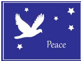
St. Theresa School at Kekaha

Vision/Mission Statement To make St. Theresa Parish a dynamic Christian community of worship & service