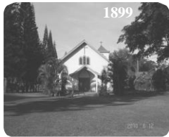
Sacred Heart of Jesus & Mary at Waimea