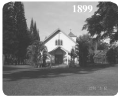
Sacred Heart of Jesus & Mary at Waimea