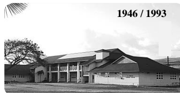
1946 / 1993