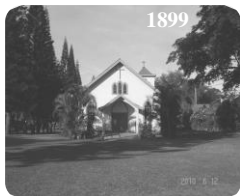
Sacred Heart of Jesus & Mary at Waimea