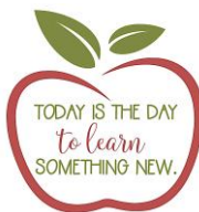
St. Theresa School at Kekaha

Vision/Mission Statement To make St. Theresa Parish a dynamic Christian community of worship & service