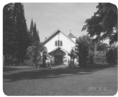
Sacred Heart of Jesus & Mary at Waimea