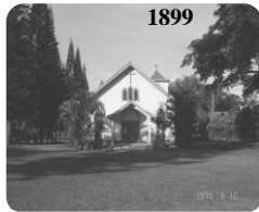
Sacred Heart of Jesus & Mary at Waimea