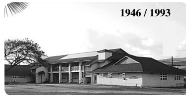
St. Theresa School at Kekaha

Vision/Mission Statement To make St. Theresa Parish a dynamic Christian community of worship & service