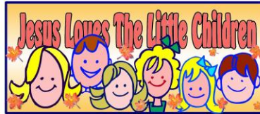
St. Theresa School at Kekaha

Vision/Mission Statement To make St. Theresa Parish a dynamic Christian community of worship & service