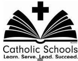
St. Theresa School at Kekaha

Vision/Mission Statement To make St. Theresa Parish a dynamic Christian community of worship & service