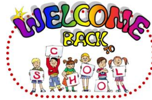
St. Theresa School at Kekaha

Vision/Mission Statement To make St. Theresa Parish a dynamic Christian community of worship & service