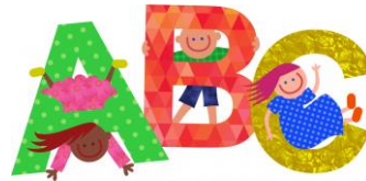
St. Theresa School at Kekaha

Vision/Mission Statement To make St. Theresa Parish a dynamic Christian community of worship & service