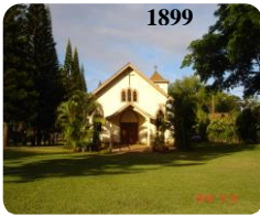
Sacred Heart of Jesus & Mary at Waimea