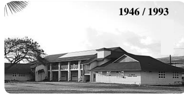
1946 / 1993