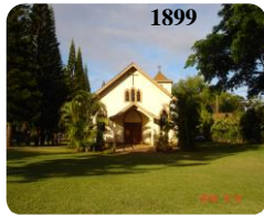
Sacred Heart of Jesus & Mary at Waimea