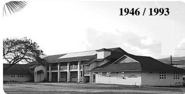
St. Theresa School at Kekaha

Mahalo to all who helped in any way to contribute to the success of this year's STS Carnival! God bless you!