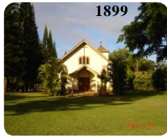
Sacred Heart of Jesus & Mary at Waimea