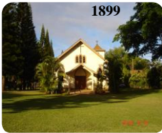
Sacred Heart of Jesus & Mary at Waimea